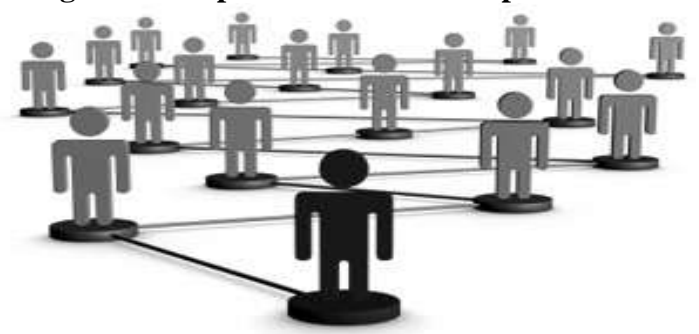
Figure 01: representation of entrepreneurial<sup>3</sup>